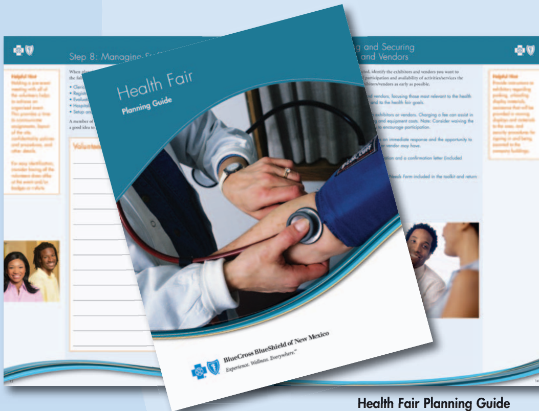
Health Fair Planning Guide 48933.0408

Health fairs can be complex events encompassing many activities and learning opportunities, or they can be as simple as offering a health screening or flu shot. The needs of your organization will dictate the health fair you undertake. Use the Health Fair Planning Guide as a starting point.