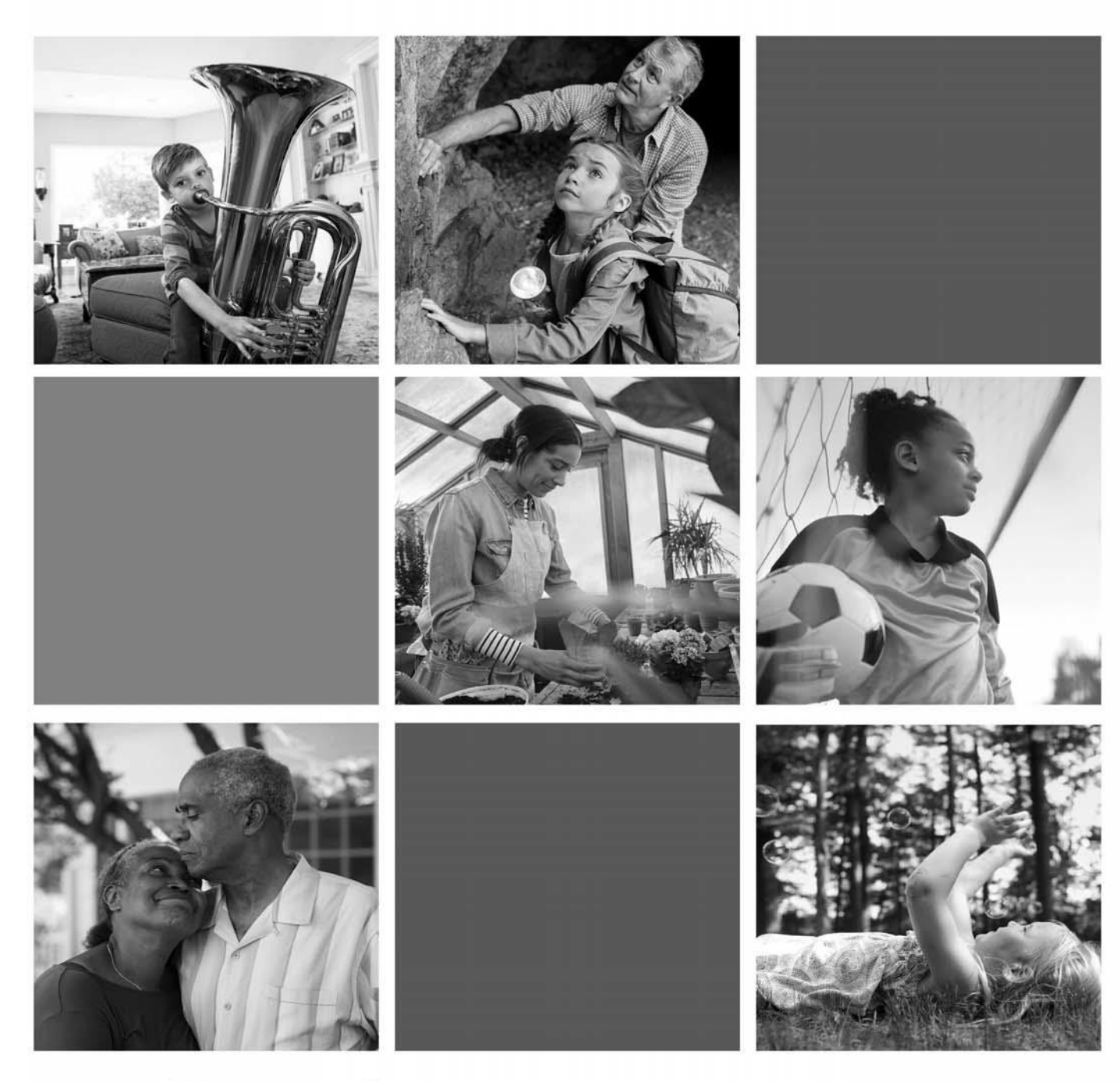
Your Health Care Benefits Program